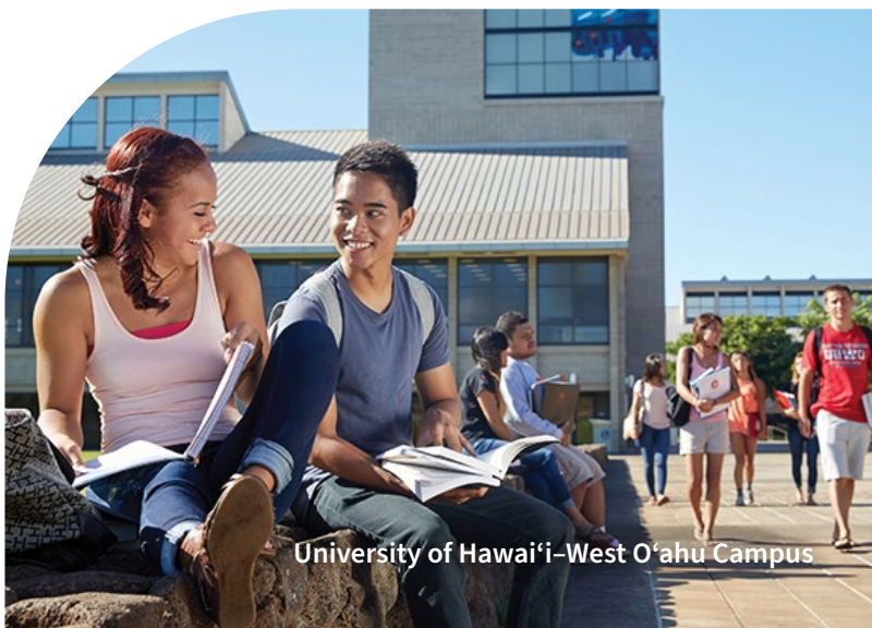
University of Hawai'i–West O'ahu Campus

During the COVID-19 pandemic, UHCC and industry partners helped to alleviate the economic impact to Hawai'i residents through the Good Jobs Hawai'i program, which provided free job training to upskill and attain industry certifications, opening doors to employment opportunities, paid internships, and apprenticeship pathways. UHCC continues to offer these training classes due to their popularity and effectiveness.