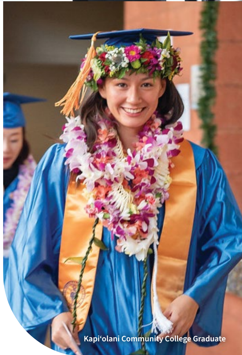
Kapi'olani Community College Graduate

The University of Hawai'i President's position is presently classified as an SM-5, which pays between $283,500 to $393,750. Salaries exceeding the established range are subject to approval by the Board of Regents per Regent Policy 9.212, and the salary of the current President is $430,200. The compensation for the next System President is under review by the Board which may consider a new range based on the current market, and the new range will be posted once available. Ultimately, the Board of Regents approve both the appointment of and salary (in-range and exceeding range) for the University President.