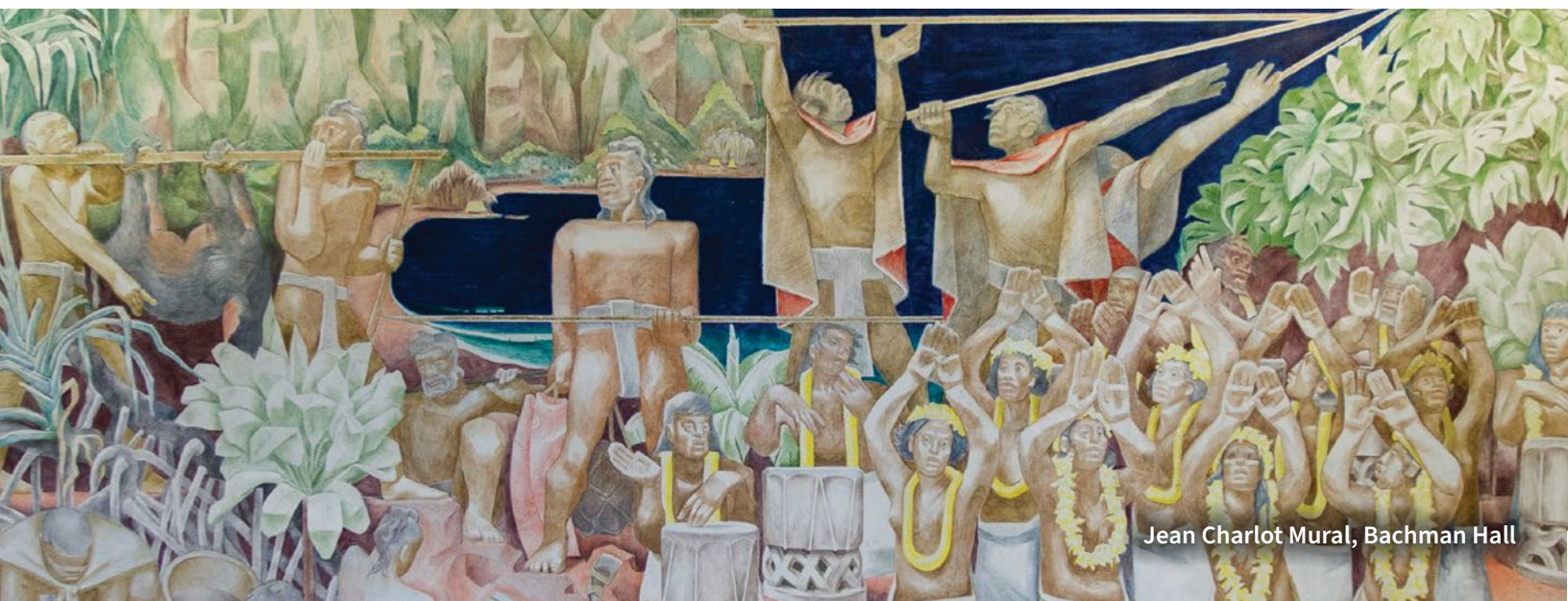
Jean Charlot Mural, Bachman Hall

For information on how to apply or to submit nominations, please refer to the section “Procedure for Candidacy” at the end of this document.