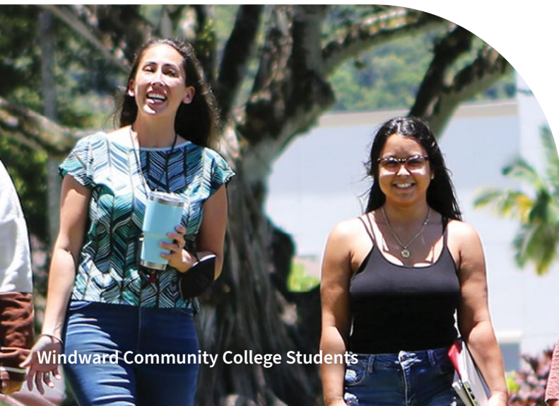
Windward Community College Students

Unique among Windward CC's outreach programs, the Hawai'i Music Institute features local entertainers and industry professionals sharing their knowledge about music and the business of music.