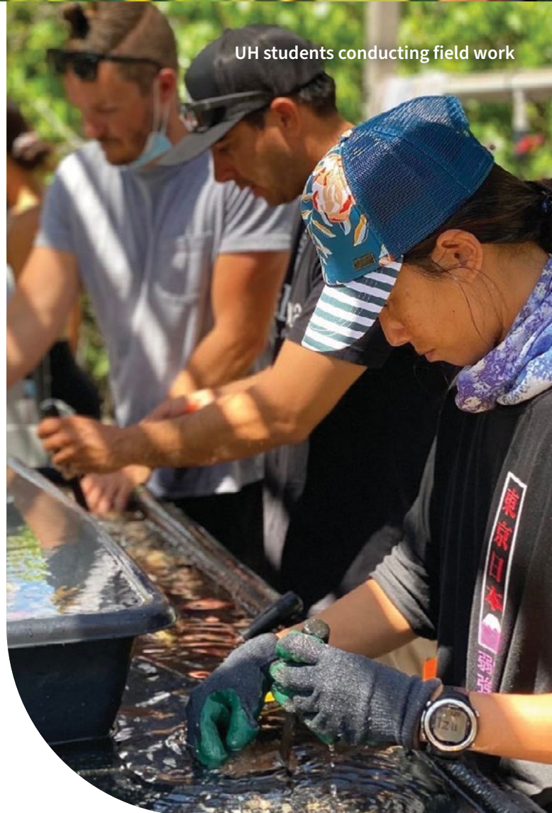
UH students conducting field work

Institutionally, UH is committed to being a leader in renewable energy and has a goal to become net-zero energy by 2035, exceeding and in full support of the State's goals to be 100% renewable by 2045.