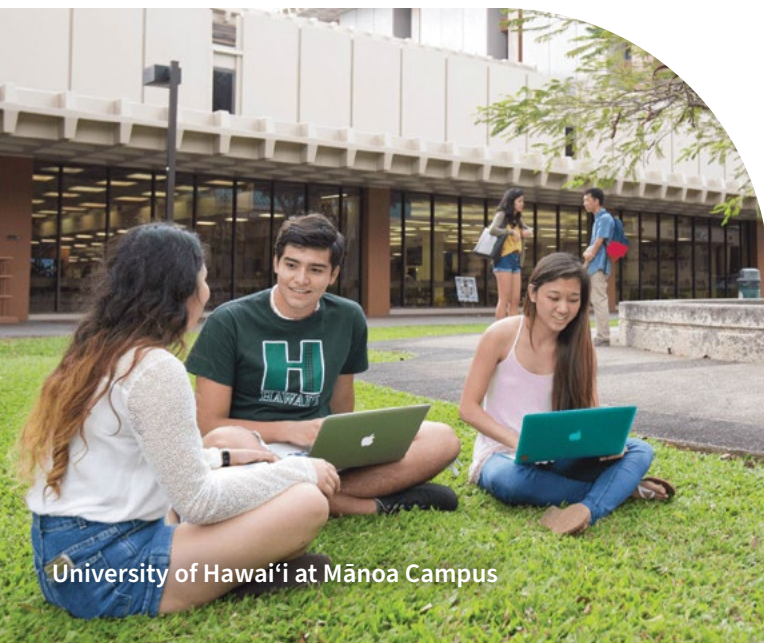
University of Hawai'i at Mānoa Campus

Approximately 3,000 students attend UH Hilo, and the campus ranks in the top 10 for both ethnic diversity and the low percentage of students with debt at graduation, according to U.S. News and World Reports. UH Hilo offers 36 bachelor's