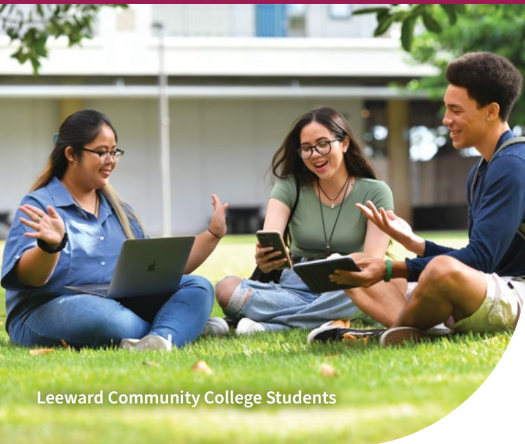
Leeward Community College Students