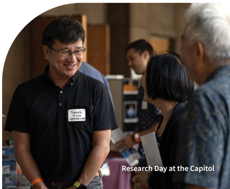
Research Day at the Capitol

The UH System seeks a visionary President capable of harnessing our strengths in international education while seamlessly integrating this mission with our strategic imperatives to diversify Hawai’i’s economy, prepare UH students for global careers, and serve Indigenous communities. The ideal candidate will possess strategic foresight to ensure that our international endeavors align with and enhance our Indigenous-serving commitments, fostering mutually beneficial relationships with local and global stakeholders. These efforts will include synergistic partnerships with the East-West Center, as well as leveraging institutional expertise of the National Resource Centers for the Pacific, Southeast Asia, and East Asia.