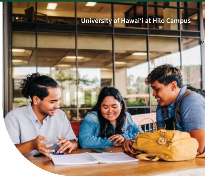
University of Hawai'i at Hilo Campus

Today, nearly 20,000 students representing 122 countries are enrolled in UH Mānoa courses, on campus or via distance delivery, studying toward bachelor's degrees in 99 fields of study, master's degrees in 87, doctorates in 57, first professional degrees in architecture, law, and medicine, and a total of 70 undergraduate and graduate certificates. UH Mānoa also offers 3 post-baccalaureate certificates. There are 316 degrees and certificates offered in total.